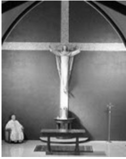
Our Lady of Sorrows Church 3816 East State St. Ext.