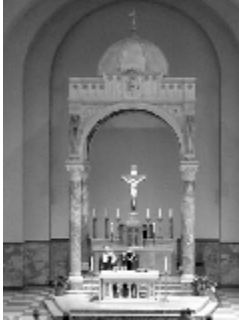
St. Anthony Church 626 South Olden Ave.