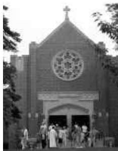
3816 East State St. Ext.

Parish Office: 3816 East State St. Ext. Hamilton, NJ 08619