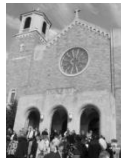
626 S. Olden Ave.