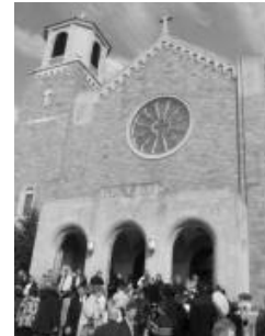
626 S. Olden Ave.