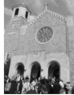
626 S. Olden Ave.