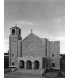
626 S. Olden Ave.