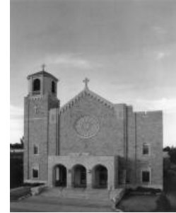
626 S. Olden Ave.