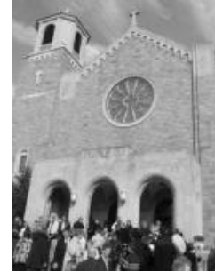
626 S. Olden Ave.