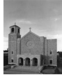
626 S. Olden Ave.