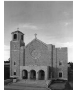
626 S. Olden Ave.