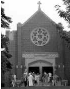
3816 East State St. Ext.

Parish Office: 3816 East State St. Ext. Hamilton, NJ 08619