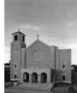
626 S. Olden Ave.