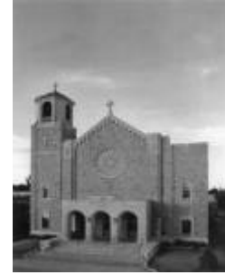
626 S. Olden Ave.