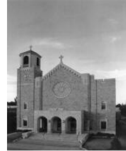
626 S. Olden Ave.