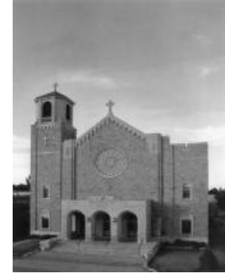
626 S. Olden Ave.