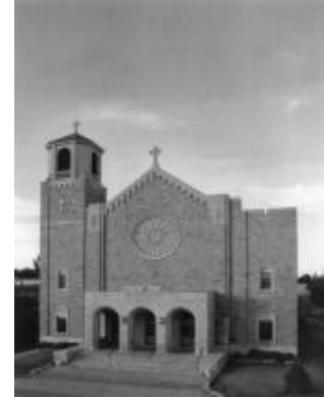
626 S. Olden Ave.

Worship & Sacramental Life OLS: Our Lady of Sorrows Church SA: St. Anthony Church