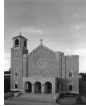
626 S. Olden Ave.

Worship & Sacramental Life OLS: Our Lady of Sorrows Church SA: St. Anthony Church