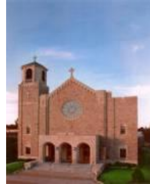
626 S. Olden Ave.