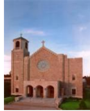
626 S. Olden Ave.

Worship & Sacramental Life OLS: Our Lady of Sorrows Church SA: St. Anthony Church