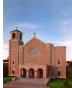
626 S. Olden Ave.

Worship & Sacramental Life OLS: Our Lady of Sorrows Church SA: St. Anthony Church