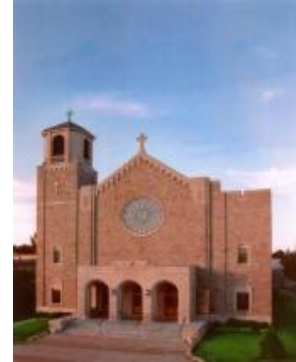
626 S. Olden Ave.

Worship & Sacramental Life OLS: Our Lady of Sorrows Church SA: St. Anthony Church