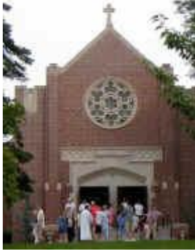
3816 East State St. Ext.

Parish Office: 3816 East State St. Ext. Hamilton, NJ 08619