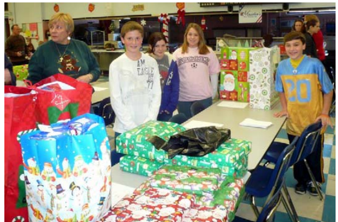
Our Lady of Sorrows – St. Anthony's: wrapped gifts were received, organized, accounted for and delivered to Martin House.