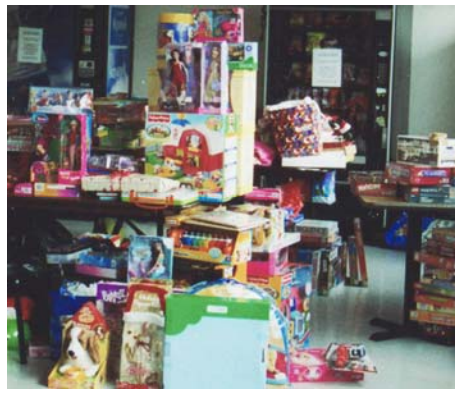
Extra, unmarked gifts are wrapped and used to respond to last minute needs.