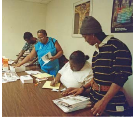
Later, families and gifts being coordinated and appropriately distributed

Through your great generosity, cooperation, work and diligence we shared with 533 families and approximately 1,800 children. A special effort was made for the 15 families who reside in our Transitional Housing, Doorway to Hope, our pre-school which has 65 children in attendance and our after-school program, comprised of approximately 60 children.