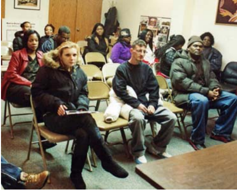
First gathering of 20 to 30 families to receive their personally given gifts.