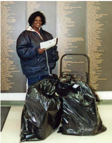
The families leave with their Christmas sharing gifts. The only thing better than the gifts is the generosity and effort to make it happen. We thank God and all for their great and true spirit on celebrating the birth of Jesus Christ.